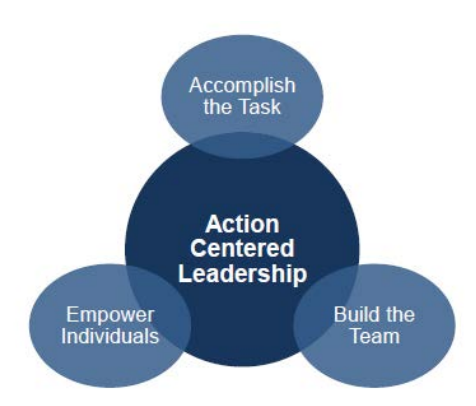
Figure 4:1 Action Centred Leadership

At its simplest form, the model can be described by how it divides leadership into the areas of 'Task', 'Team' and 'Individual'. Each element plays an important role in the leadership picture, and only when all three are balanced properly will the leader be achieving success.