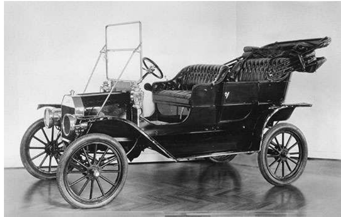
Figure 1.1: The 1909 Ford Model T

Ford's mass production philosophies were hugely successful at increasing the production rate, at the introduction in 1913, the production numbers were greater than the total from the past four years. By 1914, the production lines were able to produce thousands of the Model T every week and in 1924 the River Rouge Plant in Michigan could produce 10,000 engine blocks for the Model T every day. The total number of Model T's purchased is around 15 million over a 19-year period with the cost reaching as low as $300, and accounted for roughly 40% of cars on the roads in the United States. Fig.1.2 shows the annual production output for the Model T, and a comparison of its price customers paid.