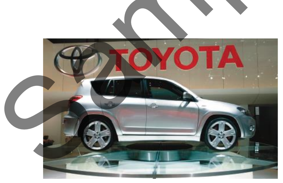
Figure 1.1: Toyota RAV4 Sports Concept

The TPS is based on several fundamental principles and philosophies which were started by the founding Toyoda family and later developed by the company's executive, Taiichi Ohno. Toyota continues to be a market-leader thanks, in no small part, to the TPS which is continually being refined and improved in order to achieve large volume manufacturing along with high flexibility, all the while maintaining low inventory levels as well as minimal defects. The application of the TPS to its operation has allowed Toyota to get its products to market quicker than its competitors with fewer snags. As a consequence, Toyota creates satisfied customers who are more inclined to purchase their products over other competitors.