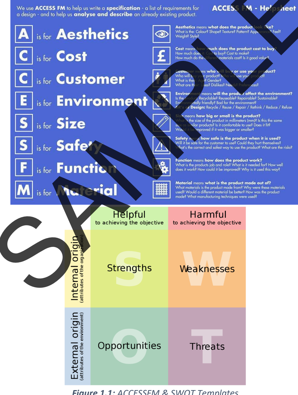
Figure 1.1: ACCESSFM & SWOT Templates

Designers and Engineers use a variety of tools and techniques to analyse the status of current products and associated processes in order to create a product analysis report. The purpose of this report is to identify weaknesses and threats whilst suggesting the strengths and opportunities for improvement of the product and processes. Advanced manufacturing processes and technologies offer potential improvements in terms of quality, productivity and sustainability. In order to quantify and justify the implementation of any potential changes, a product analysis report should be produced. In an overall product report, there should be several sections analysing the many different relevant facets; examples of tools and techniques to analyse products include ACCESSFM and SWOT.